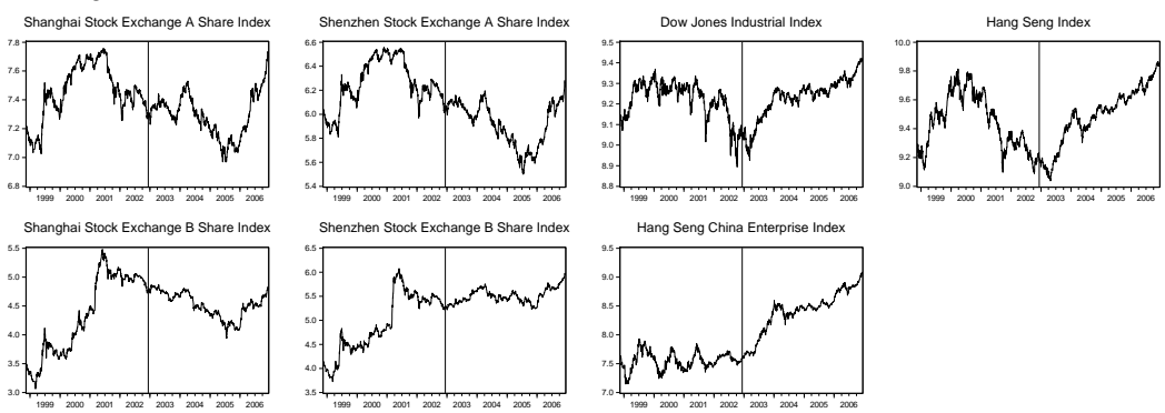
Figure 1: Log Levels Indices

Note: The graphs for the Shanghai Stock Exchange A share index (SHSE A), Shanghai Stock Exchange B share index (SHSE B), Shenzhen Stock Exchange A share index (SZSE A), Shenzhen Stock Exchange B share index (SZSE B), Dow Jones Industrial index (DJI), Hang Seng index (HSI) and Hang Seng China Enterprise index (H) are displayed. The sample covers the period 23/11/1998 to 08/12/2006.